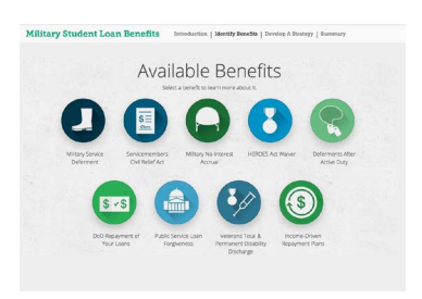
Military Student Loan Benefits