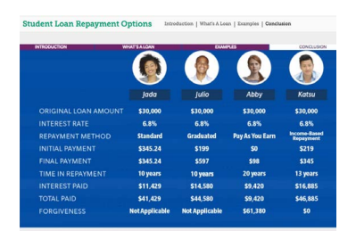
Student Loan Repayment