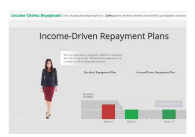
Income-driven Repayment Plans